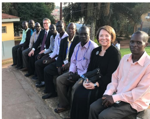
Delegates from S.Sudan & BidiBidi Camp